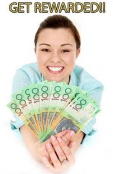
Get paid $100 cash for your opinion by attending a 90 minute focus group week commencing Monday 7th December

Club Burwood RSL is looking for people in Burwood & surrounding areas to participate in a 90 min focus group paying $100 cash! Complete survey to check you qualify. Email Michelle Leeson or call 8741 2835.